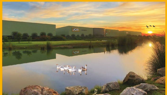
JCB's State of the Art Manufacturing Facility at Jaipur

With over 60 products in 9 product categories manufactured which are not only sold in India but also exported to more than 110 countries. To date, India has sold 350,000 backhoe loaders in the domestic market.